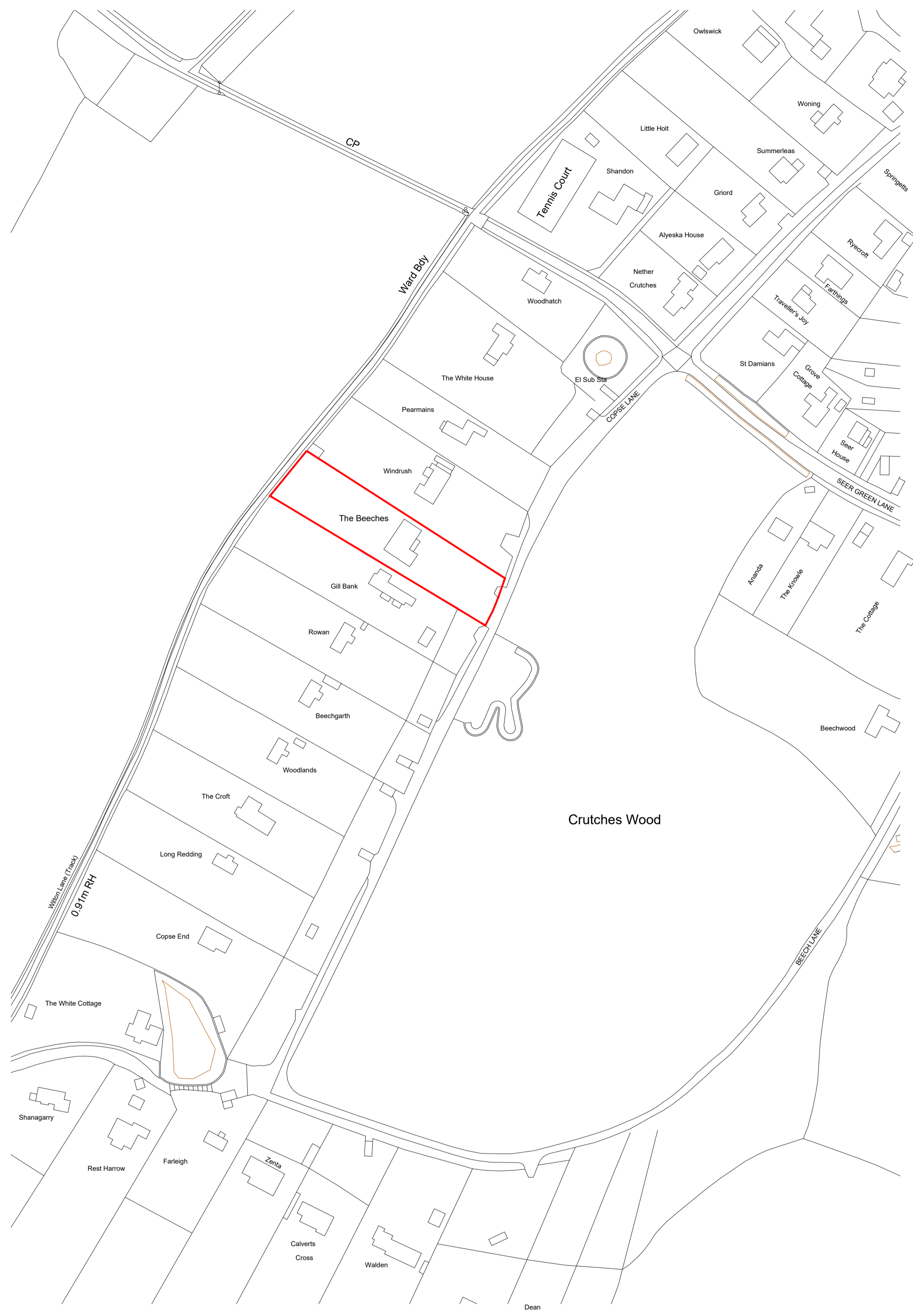
LOCATION PLAN: 1:1250 @ A1